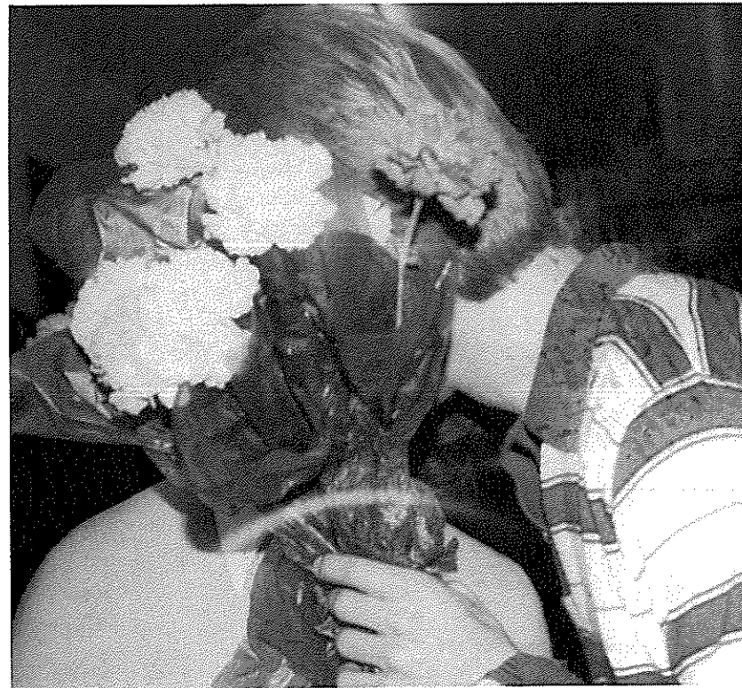
The Student Council sold carnations and cards on Valentines as a money making project.

"Hey, that wasn't one of the things sold!"